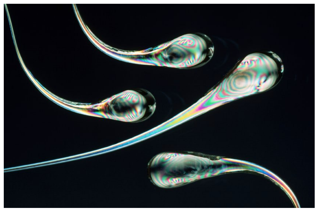
Glass suddenly cooled in water: The "Prince Rupert Drop" resists even hammer blows, but breaks immediately if his tail is damaged - due to internal stresses.